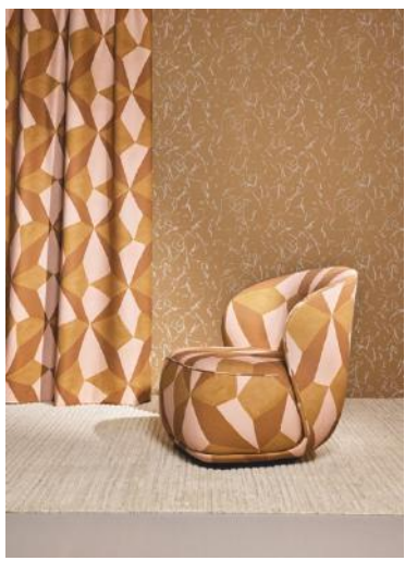
Above (from left): Marino armchair by Ercol; Graphenstone 2023 paints; Segment fabric by Kirkby Design

Other highlights to look out for include: