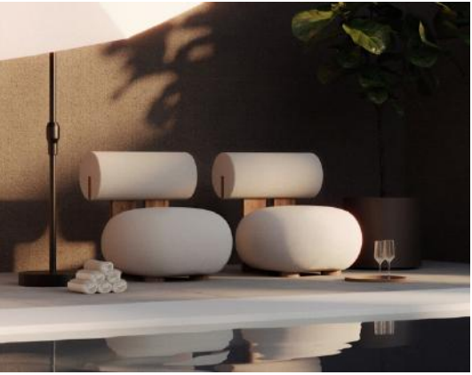
Above (from left): Bulbi concrete vases by Studiopepe for Ethimo; Hippo outdoor lounge chair by Norr11