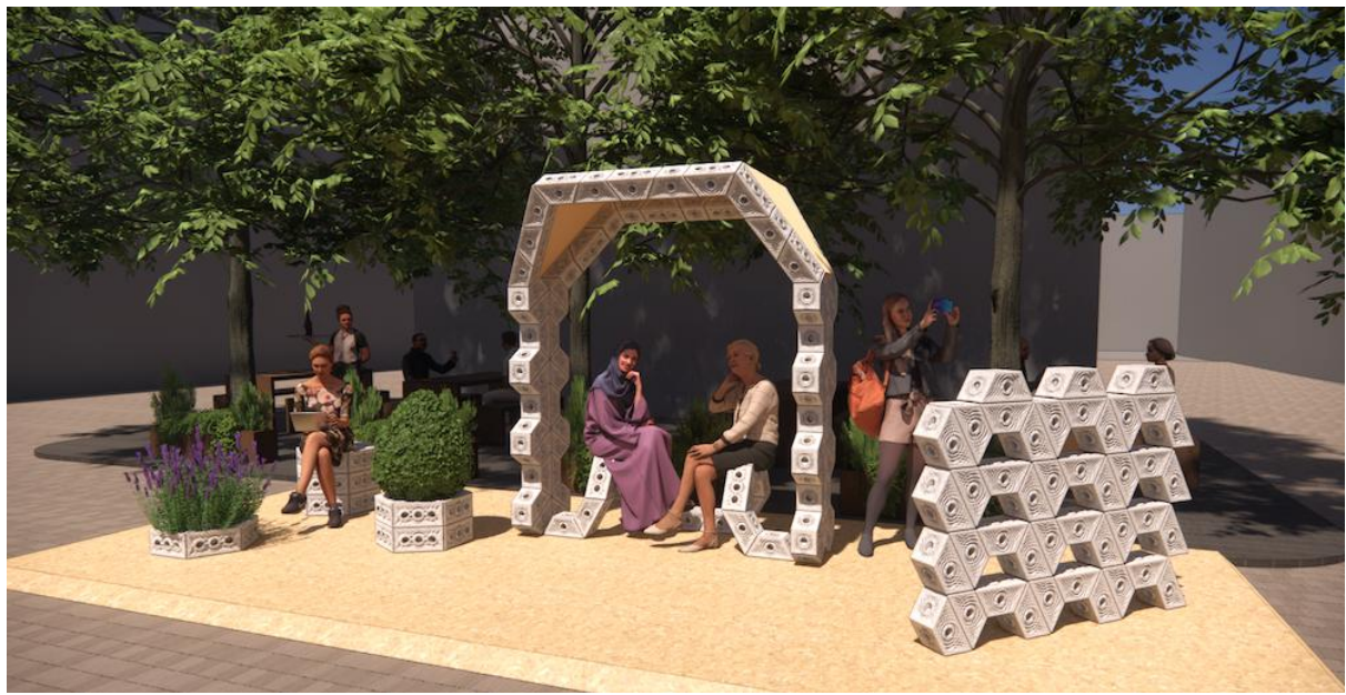
Above: SYMBIOCENE LIVING: Mycelium Building Block by PLP Architecture

Creating a more sustainable way of living – from biodiversity to reduce-reuse-recycle – remains a key subject matter for many design manufacturers and makers. Using modern technology and the latest research, many explore and propose new ways to challenge the status quo while tackling these industry-wide issues with a global outlook.