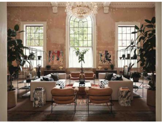
Above (from left): Terra Firma edible landscape by Heiter X; Old Sessions House, CDW's festival hub and home to Terra Firma

Over at Old Sessions House, Heiter X – a sustainable food design and experience studio founded by Estonia-based Helis Heiter – will launch its first collection of sculptural tableware in collaboration with Krohwin. Crafted using traditional building techniques and innovative 3D clay printing technology, the Mound Collection is made from raw clay and natural carnauba wax – as well as repurposed food industry waste including buckwheat and hemp shells. The collection symbolises the mounds of food wasted every day, serving as a visual reminder of the need for more conscious consumption and waste reduction.