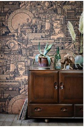
Above (from left): Recork x Sugo Cork Rugs; Hit the North cork wallpaper by The Monkey Puzzle Tree

Launched in 2022, Kent-based Recork (Project) specialises in stylish cork flooring made from 85% natural cork, harvested from trees grown in well-managed cork oak Montado. According to the ecoconscious company, it is the only one on the market that takes raw material from the Portuguese oak forests and turns production waste used for stoppers – as well as cork from early harvests – into flooring planks. Recork's stand at CDW will feature its latest rug collection – made entirely from sustainably sourced cork, wool and cotton – in partnership with Portuguese brand Sugo Cork Rugs.